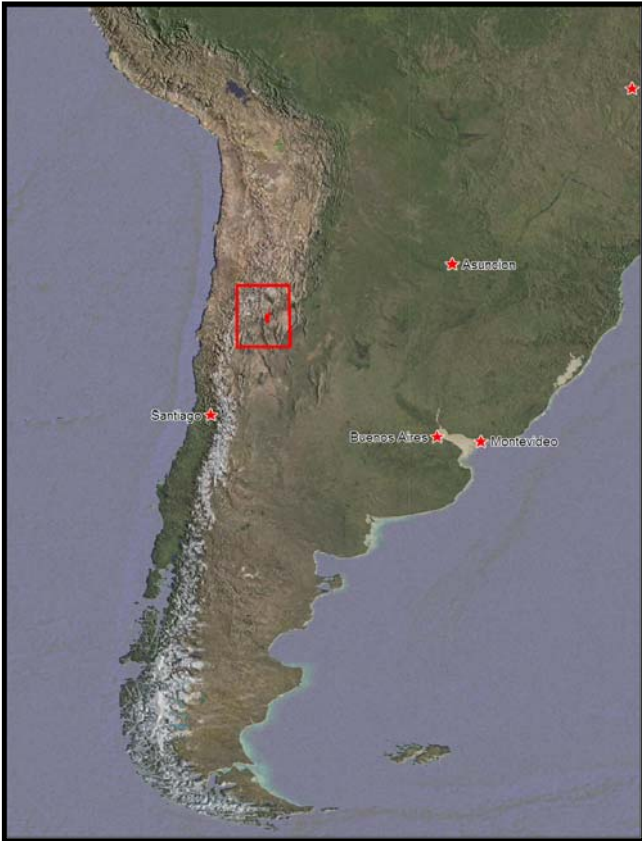
South America – Project Location